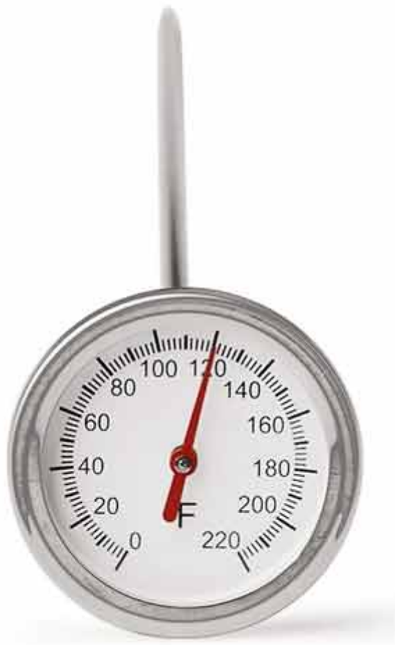
You can use a Compost Thermometer to measure soil temperatures.